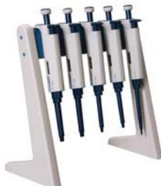
Linear Pipettor Stand

Ejector collar and tip cone ..... can be removed