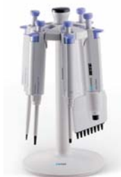
Carousel Pipettor Stand

Tip ejector allows ..... convenient one-handed operation